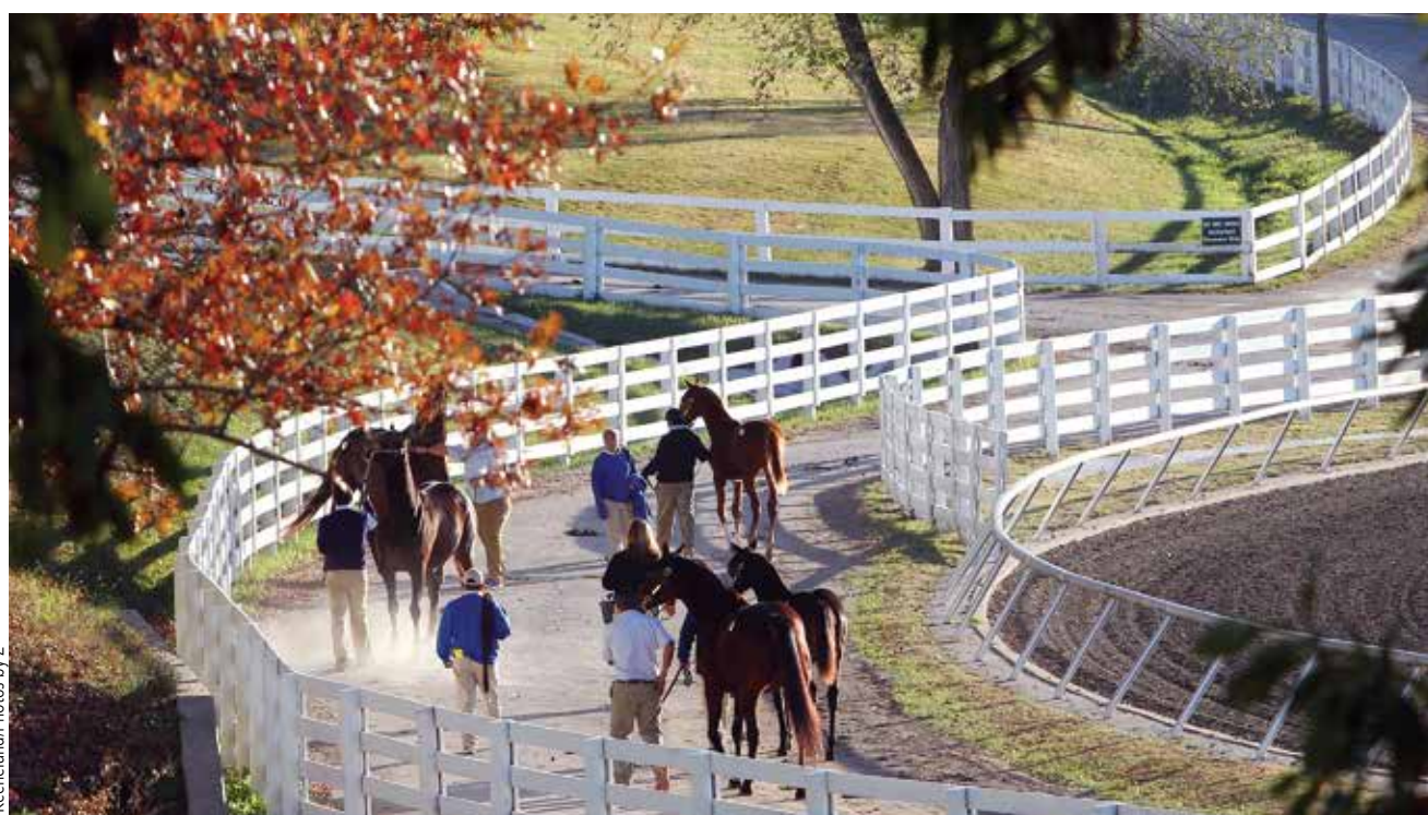
Keeneland/Photos by Z