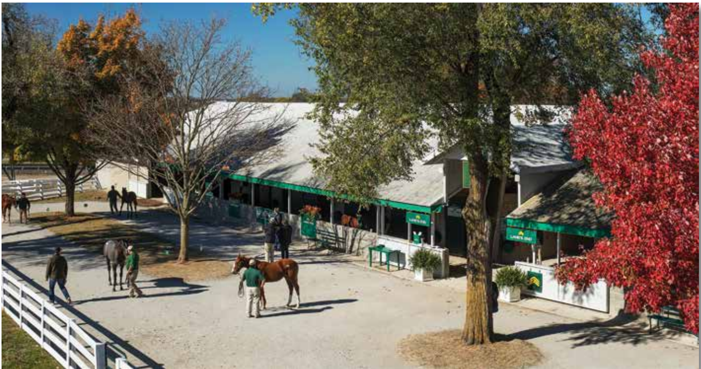
Keeneland/Photos by Z