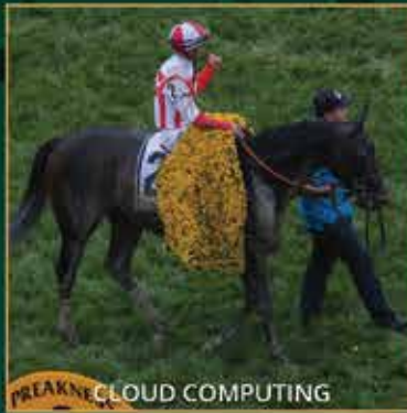
BREAKNECK CLOUD COMPUTING