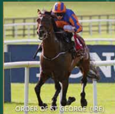
ORDER OF ST GEORGE (IRE)