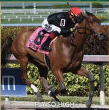
FLY SO HIGH