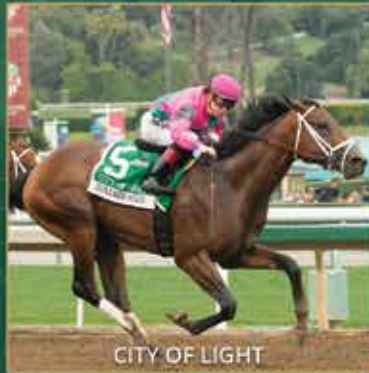
CITY OF LIGHT