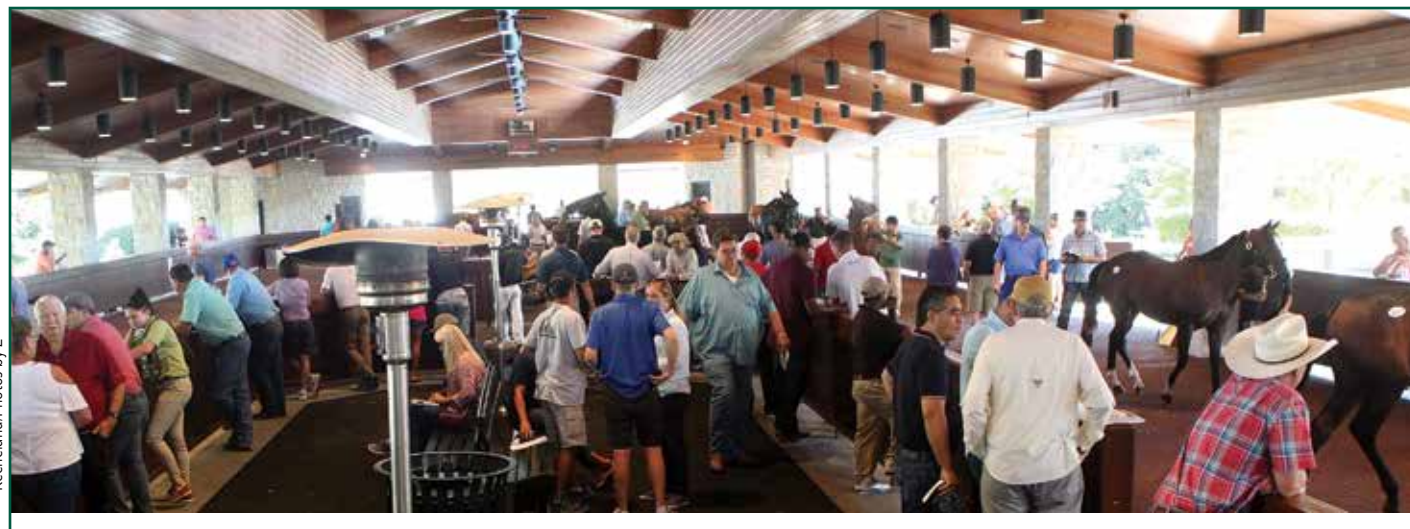
Keeneland/Photos by Z