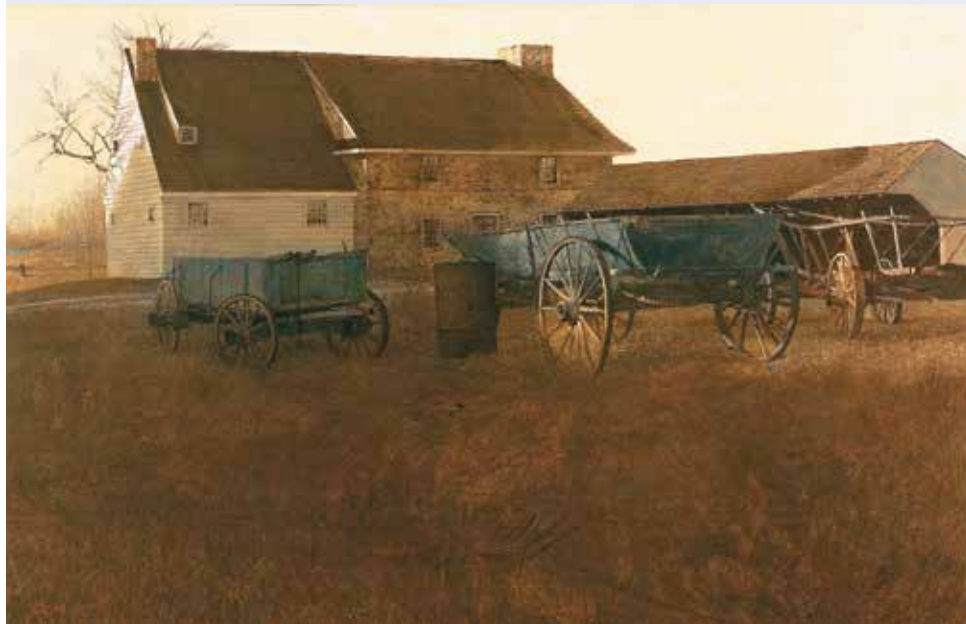
Andrew Wyeth's Marsh Hawk at one time sold for the highest price ever given for a work by a living artist.