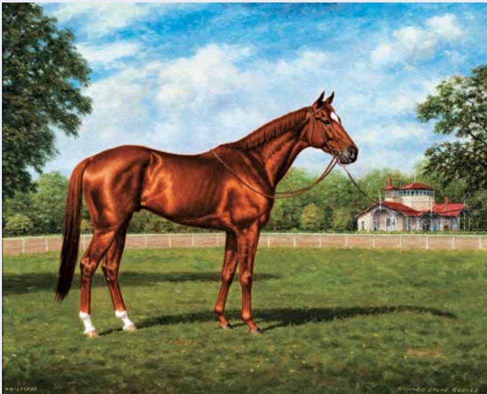
Richard Stone Reeves' Aristides: Winner of the First Kentucky Derby 1875 is among several works by the artist.