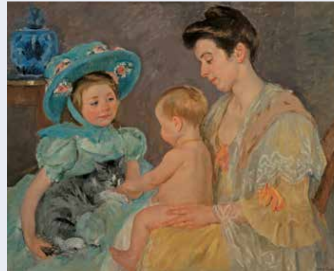
Mary Cassatt's Children Playing with a Cat is considered a fine example of the artist's focus on mothers and children.