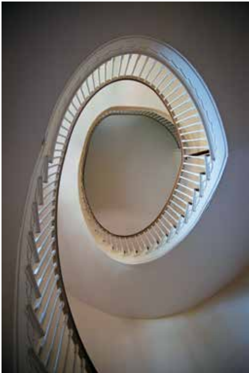
The spiral staircase is one of the house's important architectural features. Quilts that belonged to Minnie Bullock's sister and made in Eastern Kentucky remain on display today, as do Minnie's collection of snuff bottles.