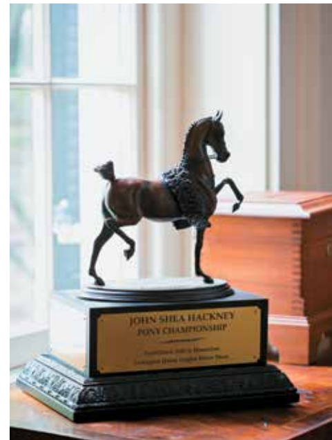
Situated throughout the house are trophies belonging to the Junior League of Lexington, which leases the Bodley-Bullock House.

Ghost and all, the Bodley-Bullock House has stood as a stalwart of Lexington through 200 years, a window to the past that continues to fill an important niche in the present. KM