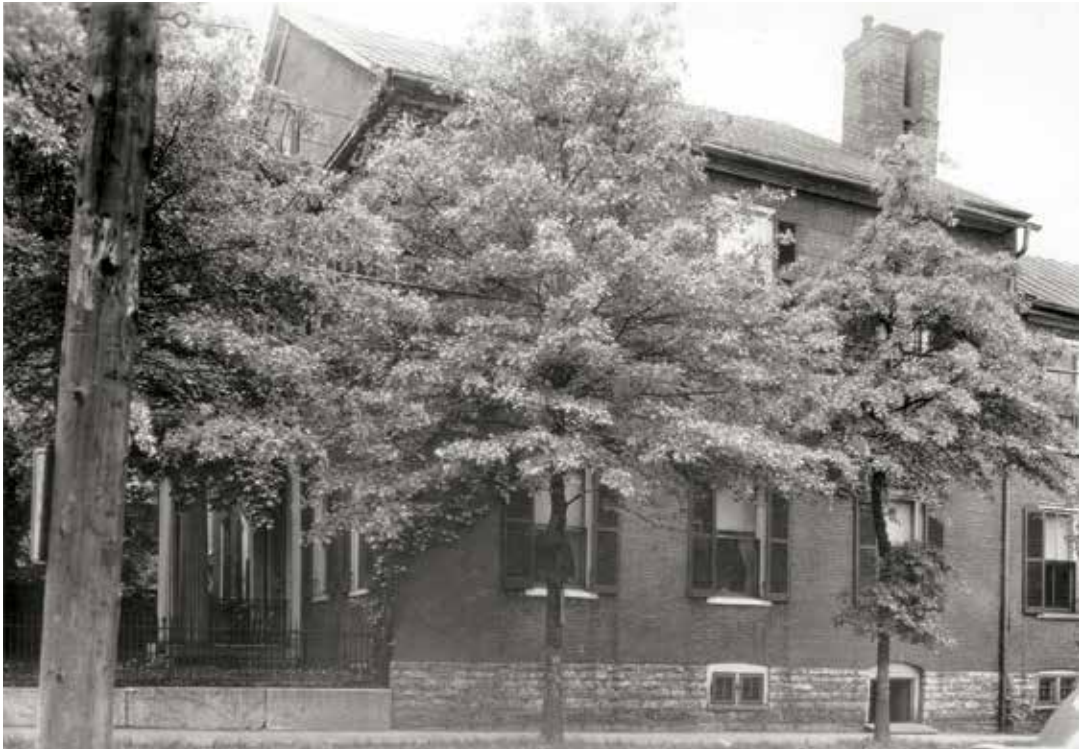
A view of the Bodley-Bullock House from West Second Street as it looked early in the 20th century

The house was built in the Federal style, a three-story brick presently measuring 14,004 square feet (with 10,498 square feet above ground) and with five windows across the second floor facing Market Street. The first and fifth windows of the second floor and the first window of the main floor were constructed as blind bays. Original Federal features included a fanlight doorway and a second-floor Palladian window.