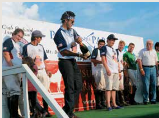
Winning team members celebrate their victory.