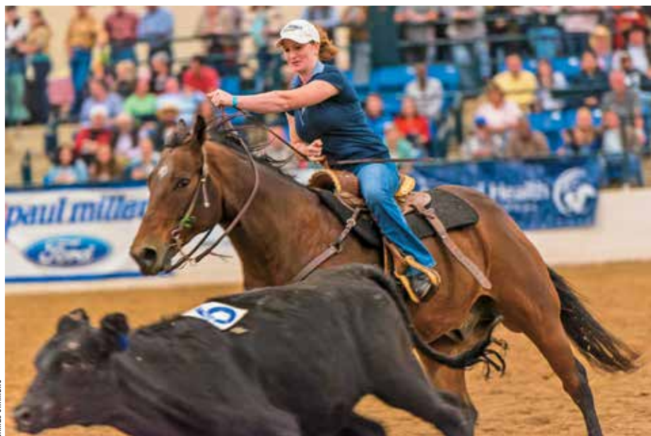
Rosie Napravnik, one of racing's most successful female jockeys, takes aim on her cow.