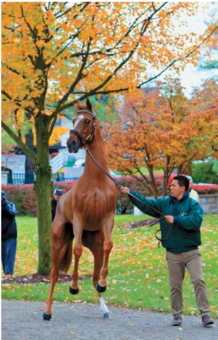
KEENEL AND PHOTO

Every consignment brings an arsenal of grooming equipment.