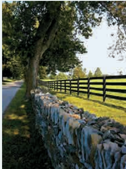
Lexington's scenic byways are hard to beat.