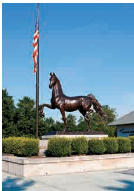
Lexington has several museums, including one dedicated to the American Saddlebred horse.