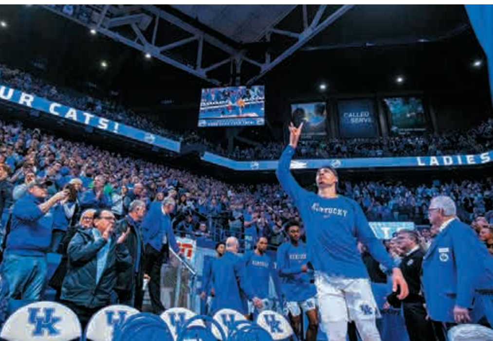
The University of Kentucky Wildcats are known to sports fans the world over. Right, the Night Market is a vibrant monthly addition to downtown Lexington.