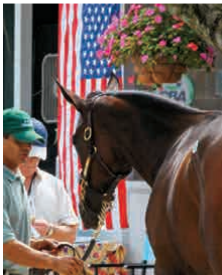
From distillery tours to horse sales, Lexington and environs offer plenty to see.

Even those who are well informed might have trouble keeping up with the latest national recognitions. Twenty years ago Lexington's national rankings could be counted on one hand; for the past several years it's earned national recognitions at a rate of two to three dozen per year.