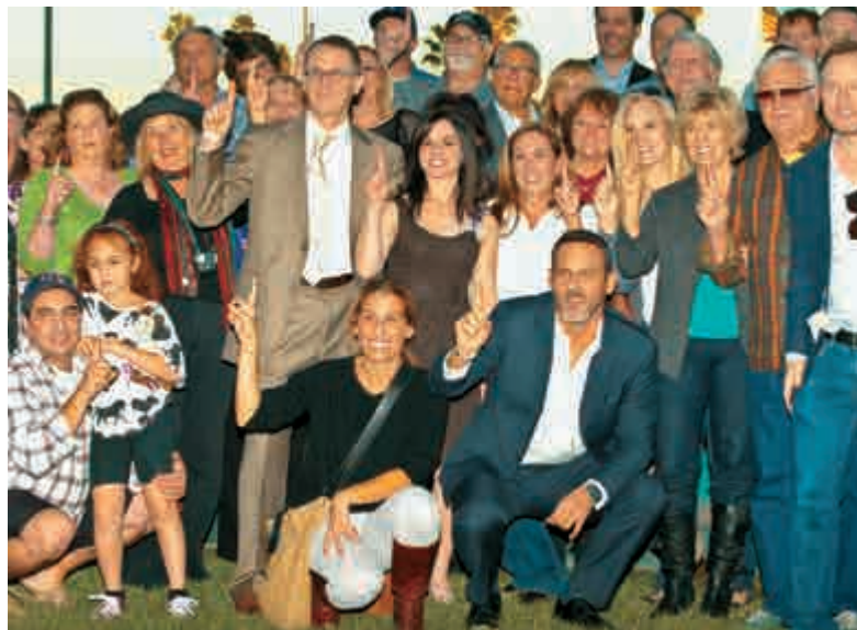
Little Red Feather's many partners support the mission of LRF Cares.

To ensure a horse has the best opportunity for a new ca-