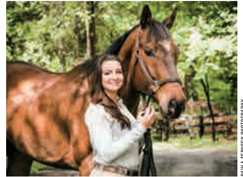
PAULA SEBISCH PHOTOGRAPHY