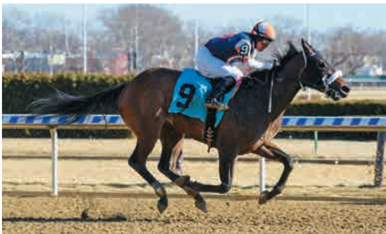
Water Trough is an example of a former partnership runner that has gone on to a second career.

reer, Little Red Feather works with organizations that place former racehorses. LRF Cares can provide funds that might be necessary for retraining should the horse go on to something like a hunter/jumper career. Funds also can go toward placing horses at one of the many retired Thoroughbred facilities throughout the U.S.