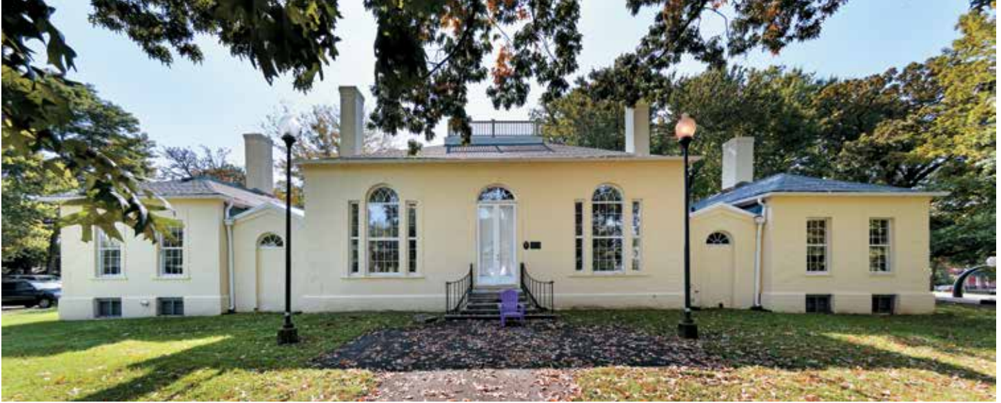
The Nest is housed in the 1810 Federal-style William Morton House on North Limestone Street in Lexington. Acquired by the city in 1913, the building's grounds now make up Duncan Park.

ing the stress these women feel and getting them on the road to handling their problems.