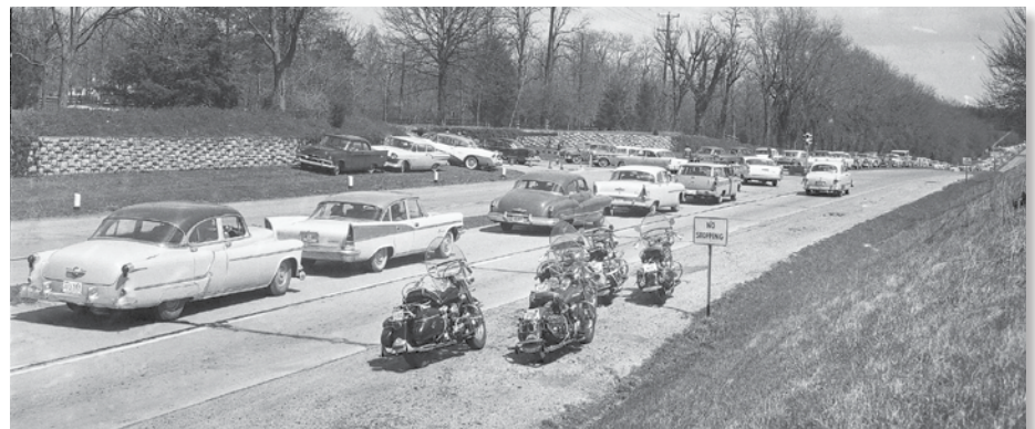
Cars lined up on Versailles Road outside the main entrance to Keeneland on April 12, 1958.

Sept. 23: Keeneland conducts an orientation about Thoroughbred racing for 13 governors attending the Southern Governor's Conference in Lexington.