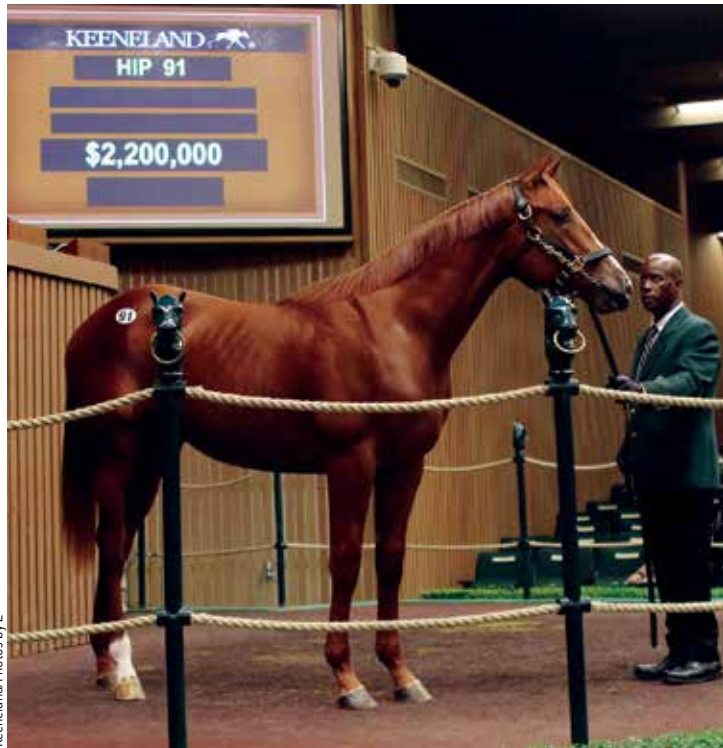
Keeneland/Photos by Z