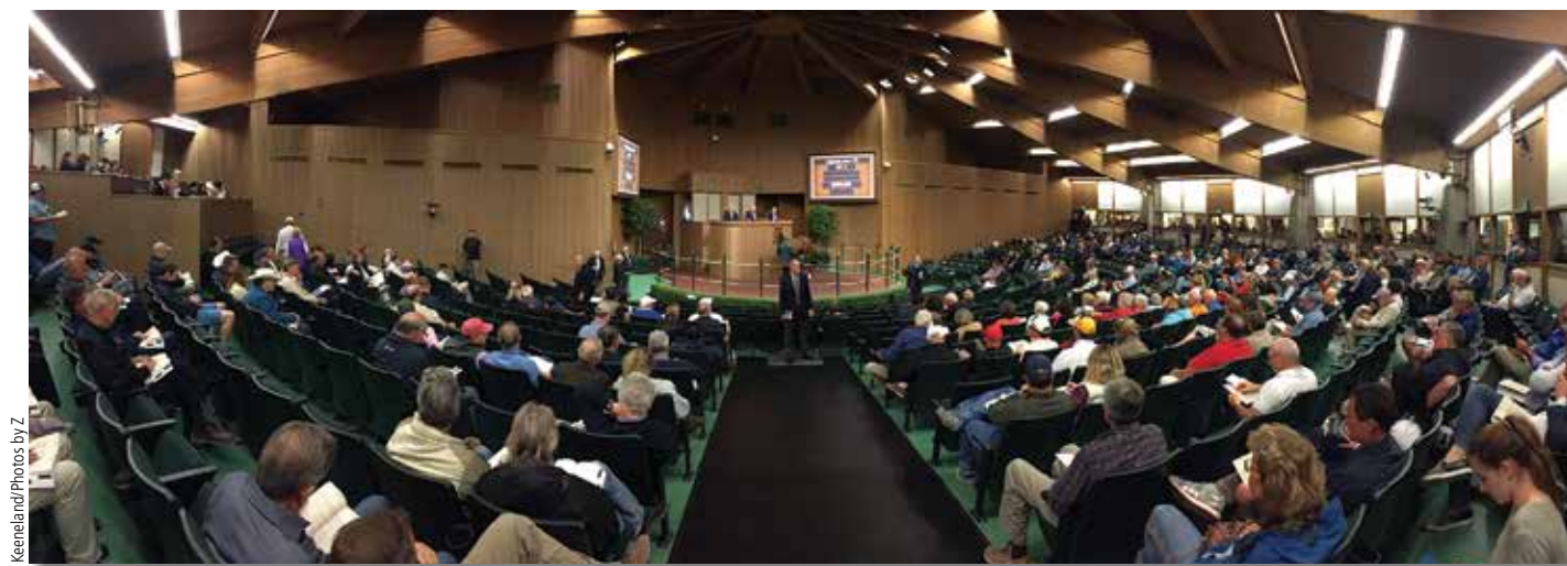
Keeneland/Photos by Z