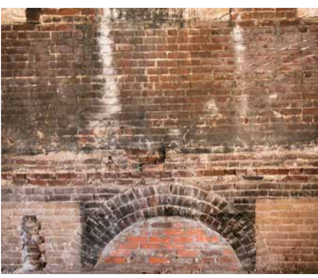
Left, the interior of the dome, which will soar 50 feet above guests on the special events level, is being meticulously restored to its earlier grandeur. Center, two decorative urns in front of the courthouse feature this "Justice" inscription as well as "Law," "Peace," and "Liberty." Right, original brickwork revealed during the current project shows an arch that had been cut off by a new floor and filled in with brickwork during the 1960-61 renovation.