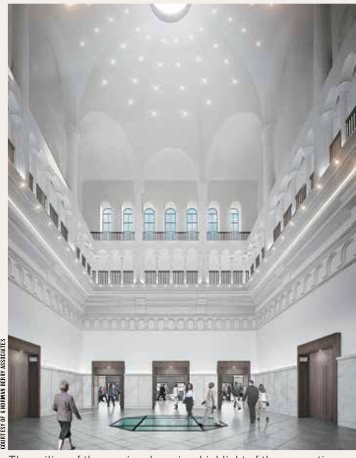
The ceiling of the soaring dome is a highlight of the renovation.

"We feel that being part of a historic renovation project and focusing on the great things going on in downtown Lexington will raise the profile of the Breeders' Cup as an integral part of the Lexington business community," he said. "If we are having potential sponsors coming to visit, it will showcase a very interesting and dynamic side to our city, and that is a complement to the Thoroughbred racing industry."