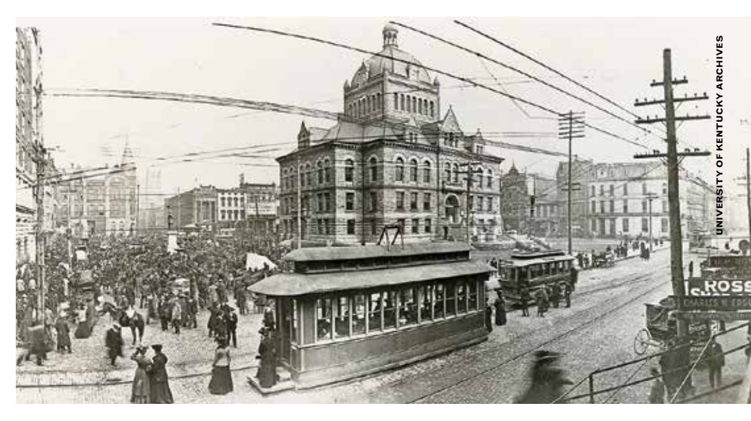
The fourth courthouse on this site, described as a "new temple of justice," was completed in 1900.

Her first project was the Midway School Apartments, setting a tone for rescuing school buildings that continues to this day. That renovation, which won a Blue Grass Trust Award for Historic Preservation, features 24 apartments and includes