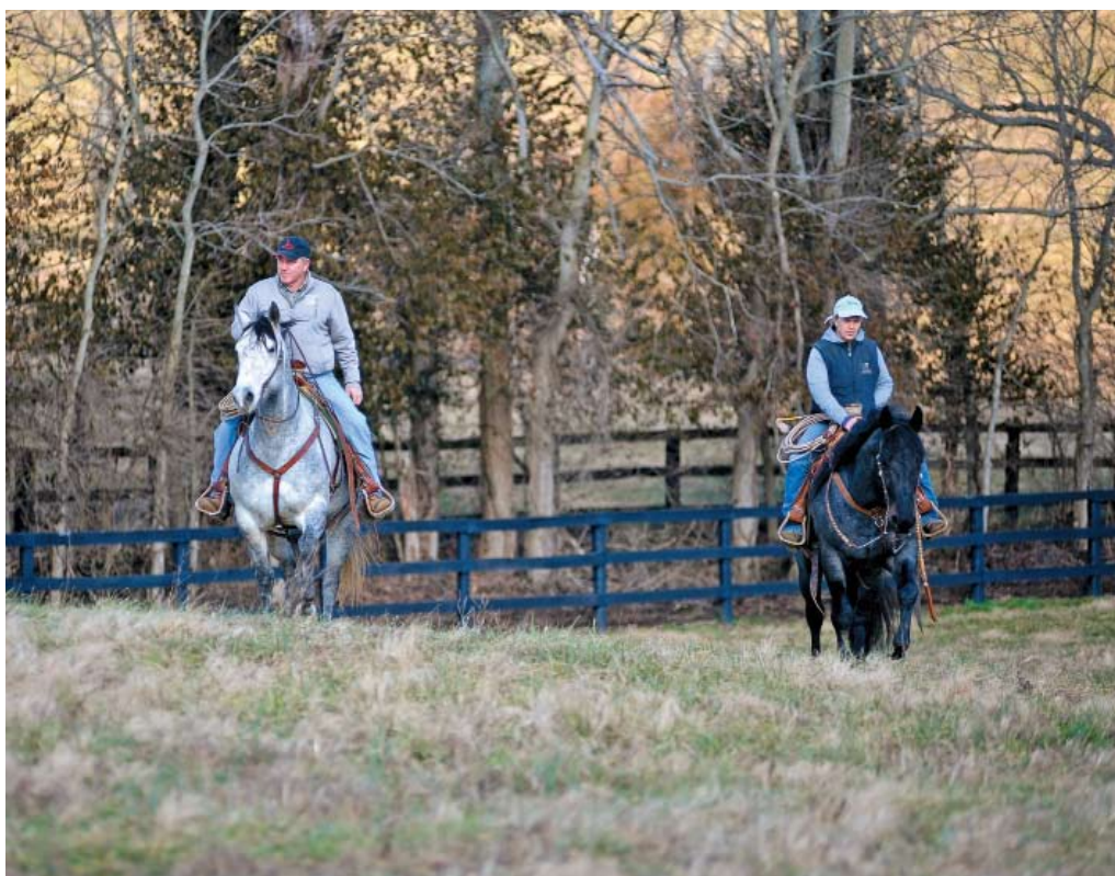
The Loprestis spend plenty of time in the saddle and enjoy cutting and roping.